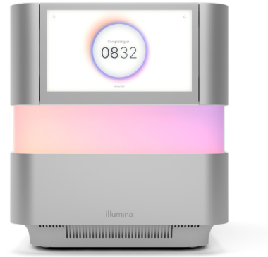
Figure 2: NextSeq 1000 and NextSeq 2000 Sequencing Systems—The NextSeq 1000 and NextSeq 2000 Systems harness XLEAP-SBS chemistry and onboard secondary analysis to streamline sequencing workflows.

The NextSeq 1000 and NextSeq 2000 exome sequencing solution offers a streamlined DNA-to-results workflow to investigate the protein-coding regions of the genome. The solution leverages industry-leading Illumina next-generation sequencing (NGS) technology and optimized sequencing by synthesis (SBS) XLEAP-SBS™ chemistry to deliver exceptional data quality. This high-accuracy exome coverage enables identification of true coding variants for a broad range of applications, including population genetics, genetic disease research, and cancer studies. The integrated workflow provides streamlined library preparation and exome enrichment, push-button sequencing, and rapid, accurate data analysis (Figure 1). With minimal hands-on time, the NextSeq 1000 and NextSeq 2000 exome sequencing solution is a highly flexible, efficient method for interrogating the exome.