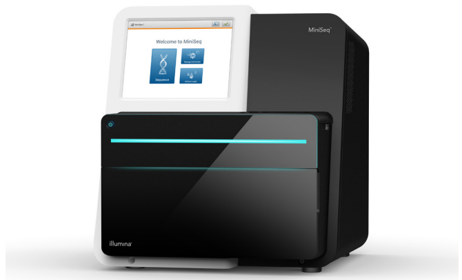
Figure 1: The MiniSeq System—By harnessing advances in SBS chemistry and simple, streamlined workflows, the MiniSeq System delivers a powerful, easy-to-use, library-to-results solution.

The MiniSeq System (Figure 1) delivers the quality and reliability of Illumina next-generation sequencing (NGS) technology in a powerful, accessible benchtop sequencer with a small footprint. This small, robust system turns a broad range of NGS methods into approachable, easy-to-use research tools, enabling researchers to take control of their sequencing projects. With the MiniSeq System, there is no need to wait to batch samples for sequencing on a high-throughput instrument; researchers can sequence on demand. It circumvents the iterative, time-consuming testing of Sanger sequencing and qPCR to allow for interrogation of individual genes to entire pathways with full-gene coverage. Laboratories of any size can perform a range of sequencing methods to deliver results and advance their research.