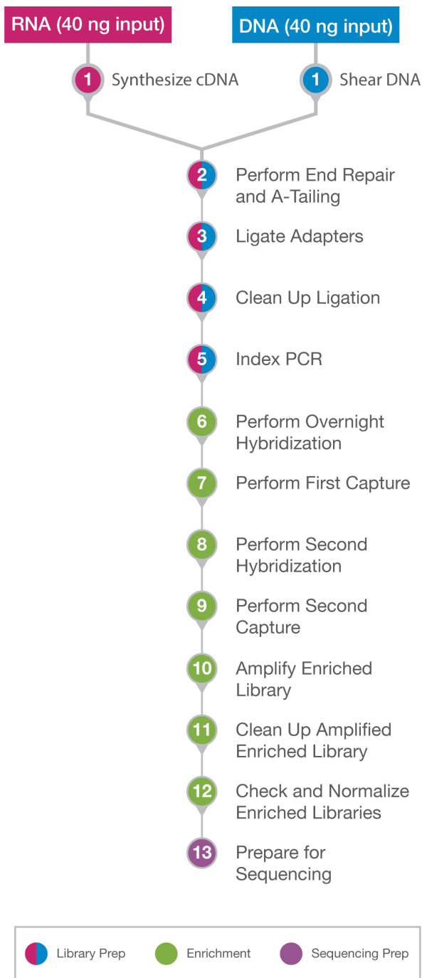
Figure 2: Combined Library Prep Workflow —The DNA and RNA samples follow the same workflow, after the cDNA synthesis step (for RNA) and the shearing step (for DNA).