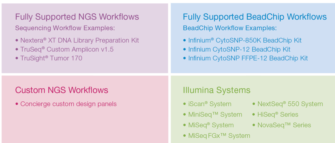
Figure 1: Illumina Proof-of-Concept Services Overview —The customized DNA-to-data Proof-of-Concept Service gives customers the flexibility to submit samples for a trial run on the HiSeq Series, NovaSeq Series, or the iScan, MiniSeq, MiSeq, MiSeq FGx, or NextSeq 550 Systems.

When considering the move to NGS or BeadChip (microarray) technology, scientists frequently navigate through many decisions regarding choice of instrumentation, applications, throughput requirements, and turnaround time. Additionally, scientists frequently inquire whether preconfigured workflows are available for specific applications and how data from a new system will compare to methods currently used in the laboratory.